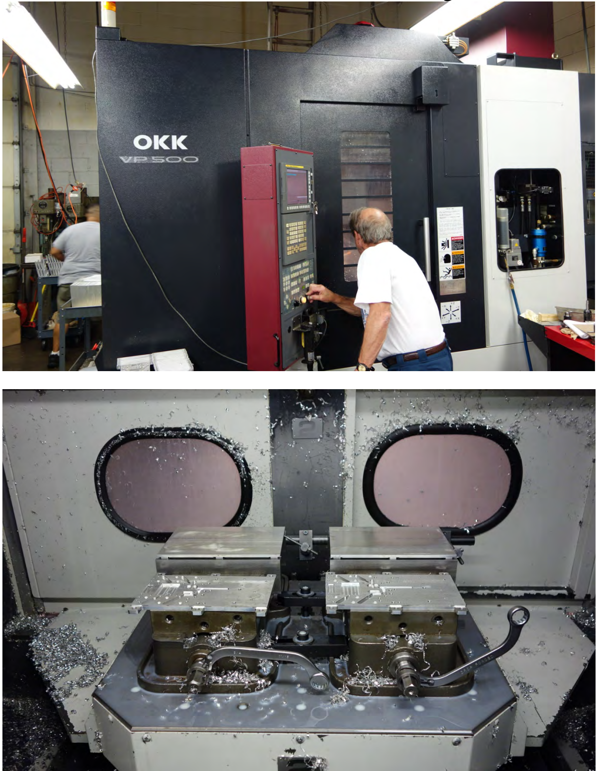
OKK VP500 – CNC Vertical Machining Center